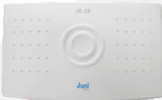
JR-20 Outdoor Antenna Unit