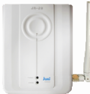
JR-20 Indoor Coverage Unit

The JR-20 has undergone the same rigorous testing and development as Juni's products that enable global cellular companies eliminate dropped calls. With this system you get the advantages of the latest technologies previously only available to cellular companies.